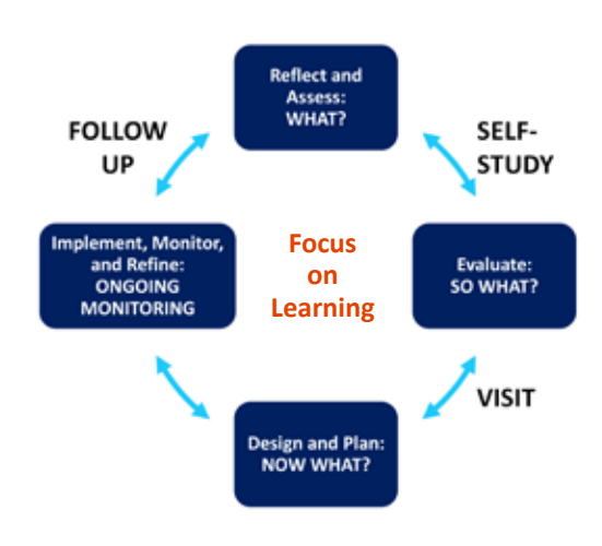
Focus on Learning: A Reflective Cycle

As we continue our formal evaluative studies and work with educators throughout our region, ACS WASC is committed to a "growth mindset" and is ready to further refine the FOL process to address the identified challenges or opportunities. The Focus on Learning accreditation process is indeed synonymous with continuous school improvement that focuses on the trustworthiness of a school as an institution for learning by all students — We Are Student-Centered.